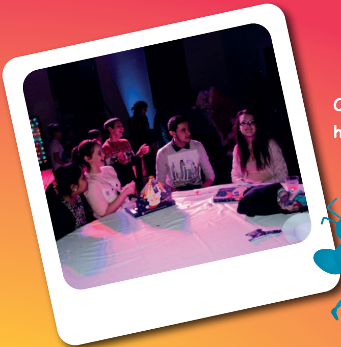
Old friends met up again and had a great time catching up.